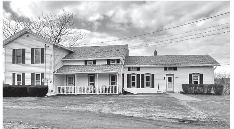
At left: A portion of an early 19th century map of Dickersonville. The road running east-west was The Niagara Road – now Route 104 – and north-south is Dickersonville Road. • Above, a modern-day look at the Raby Farm site.